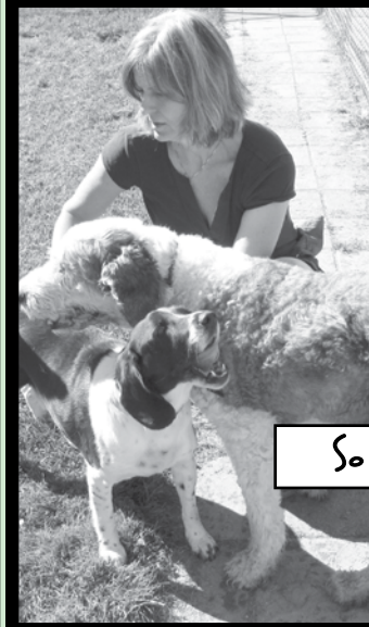
So happy together!