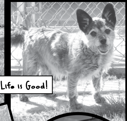
Life is Good!